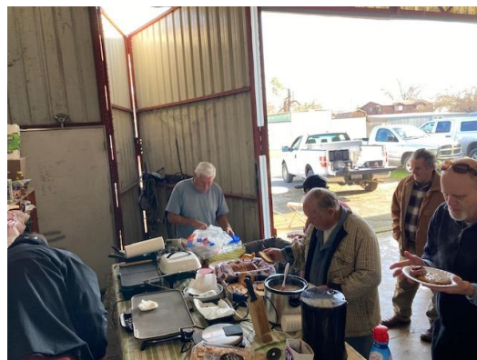
Awful Waffle