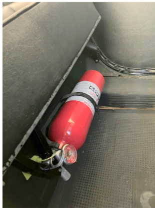
Rear seat panel

In my 21 Touring I mounted on the panel below the back seat. Both locations are readily accessible and mounted so the gauge can be seen without removing.