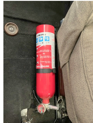
Between the front bucket seats

For my 27 Tudor I found a spot between the front bucket seats that works well.